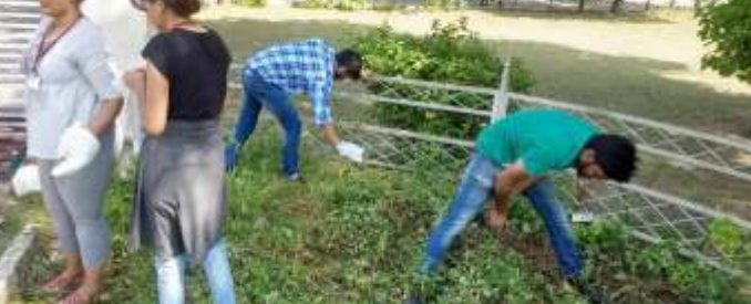
Students Participating in NSS Camp

Release of the first edition of Newsletter "Au Fait" by Hon'ble Minister of Higher Education Mrs. Kiran Maheshwari